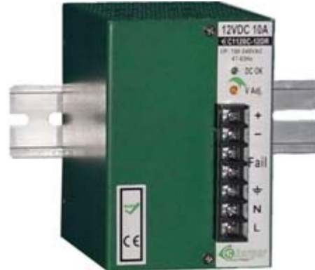
€C1120C – 12DR

The wide input voltage range allows the chargers to be used in most countries.