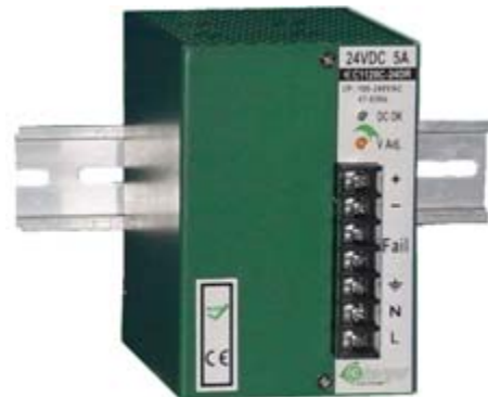
€C1120C – 24DR